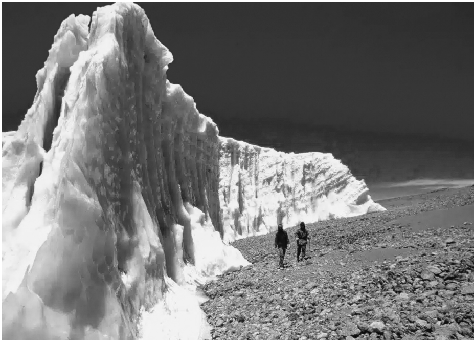
Edge of ice field on Mount Kilimanjaro

between 1912 and 2011. Experts also stress that glacier surface area alone does not reflect total ice volume, as seasonal snow and measurement differences can affect results. Peer-reviewed verification is therefore essential before drawing firm conclusions.