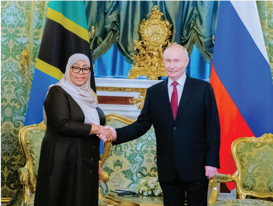
President Samia is welcomed by Russian President Vladimir Putin during her visit in June (see page 10).